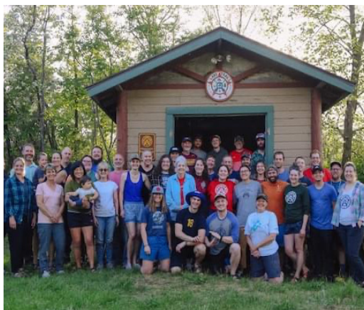
Memorial Day weekend crew at the new dock shack location