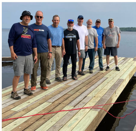
R&R Crew on their hand built dock